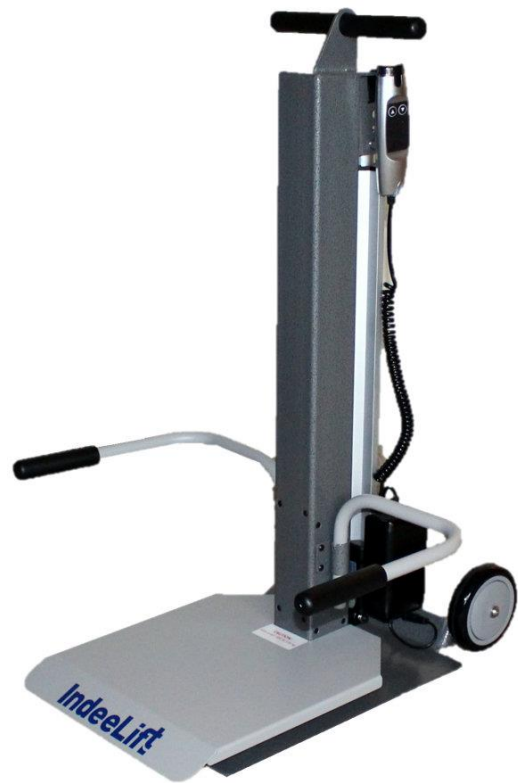
HFL-400 (400 lb. Capacity)