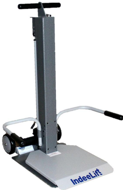
HFL-300 (300 lb. Capacity)